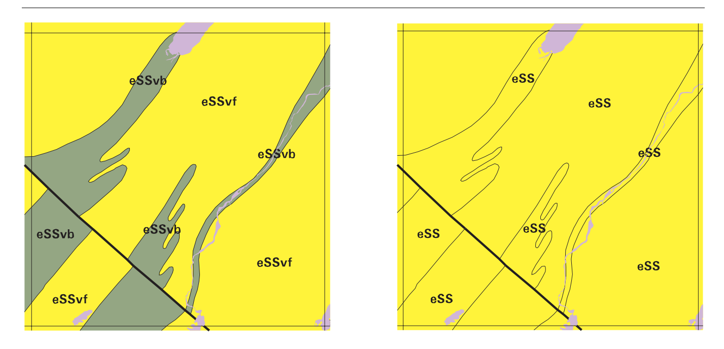
Figure 1: Part of a geological coverage from northeast Newfoundland showing geological units of the Springdale Group: (a) subdivided by lithological subunits, with formation labels (eSSvb and eSSvf, basic and felsic volcanic units respectively), and (b) at the group level, with group label eSS. The internal boundaries within the group and complex can be removed. The grid is 10 \times 10 km.

structure is required that allows this information to be generalised in various ways to permit its effective use in a GIS.